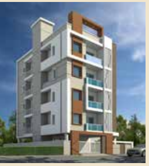
Ambience @ Postal Colony, Guntur