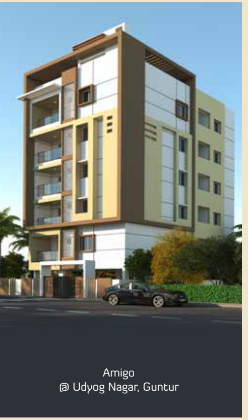
Amigo @ Udyog Nagar, Guntur