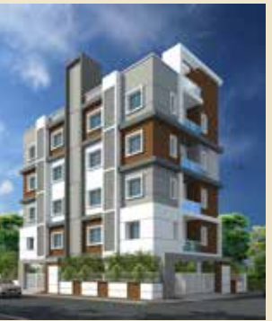
Alpine @ Postal Colony, Guntur